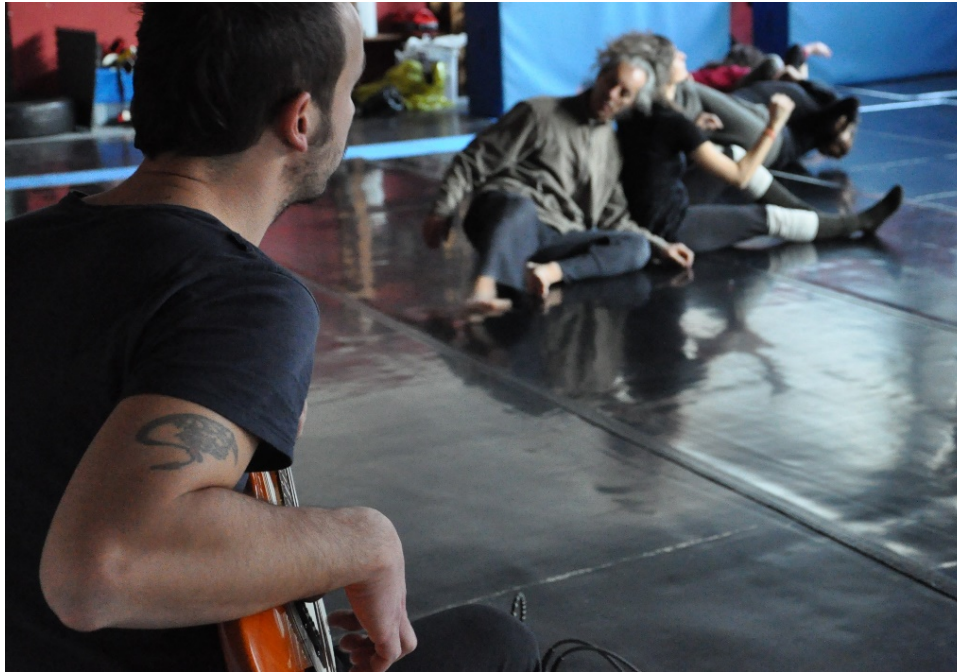
Fig. 2. Live music accompanies the dancers during a Contact Improvisation Jam in Bologna, 2015.