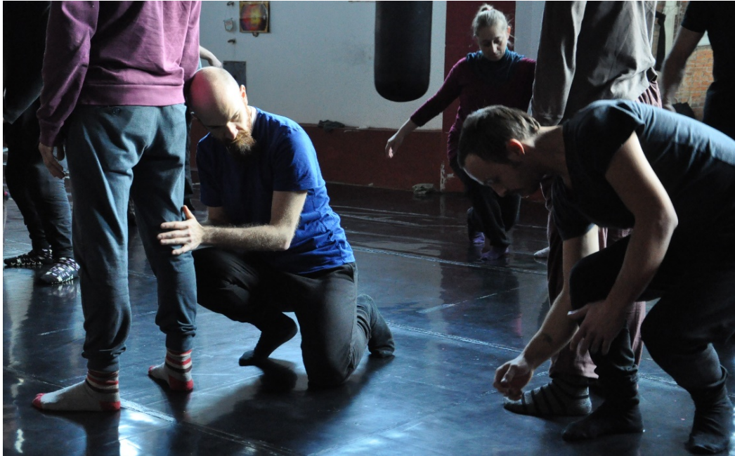
Fig. 4. Participants training interkinaesthetic awareness during a Contact Improvisation Jam's warm-up in Bologna, 2015.