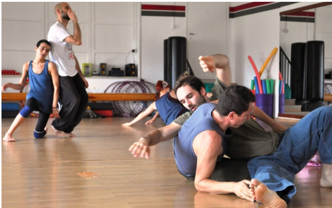
Fig. 1. Facilitator and participants practising duet movement exploration at Ferrara Contact Improvisation Workshop, 2014.

One of CI's key features that recurred often across our interviewees was the lack of a judgmental attitude among its practitioners, partly due to the improvised character of the form and the absence of a pre-set choreography.